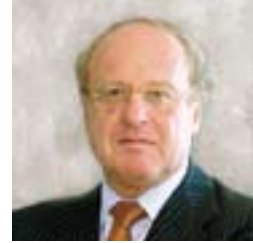
Paolo Scaroni Chief Executive Officer and General Manager