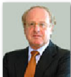
Paolo Scaroni Chief Executive Officer