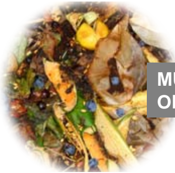
MUNICIPAL ORGANIC WASTE