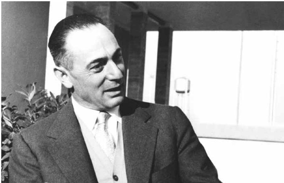
| Enrico Mattei, Eni's Chairman in 1953

It was his firm conviction that dialogue and respect for cultures constitute the cornerstones for long-term partnerships and mutual growth. Forty years on, it is possible to see that Mattei's values have endured and his philosophy still forms part of Eni's corporate philosophy. His guiding principles are today captured in the modern concept of sustainable development.