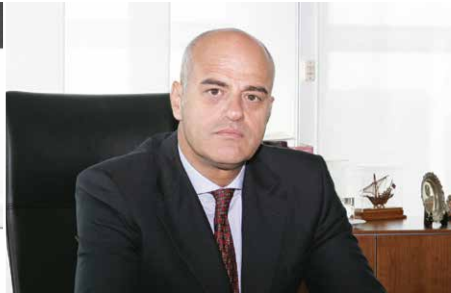
| Claudio Descalzi, Eni's CEO

Sharing has allowed us to grow and to contribute to our host's growth. We see it as imperative to develop relationships with nations, environments, cultures and people with which we interact and in which we live. Eni has, over many years, developed an unparalleled organizational culture, which is designed to build lasting, long-term relationships within the territories in which we operate.